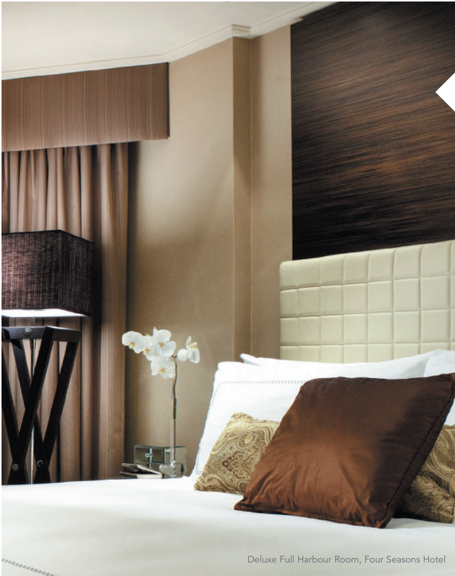
Deluxe Full Harbour Room, Four Seasons Hotel